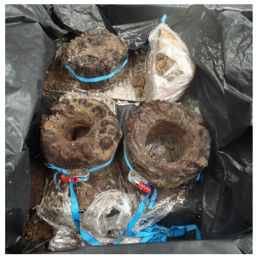
Hampton Cheeses – Found whilst realigning Great Eastern Hwy Belmont These are being preserved by Belmont Museum Photograph courtesy of Lorraine Clarke 2013