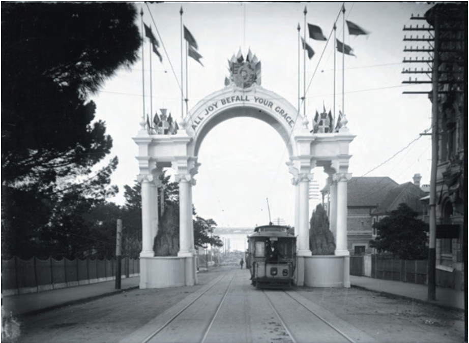
State Library of Western Australia