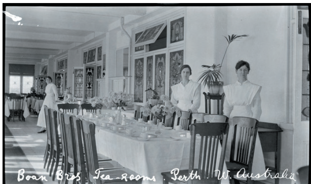
Boans Tea Rooms c1920.

He continues to contribute theatre criticism and the occasional Obituary to the West Australian – for pleasure, not for profit.