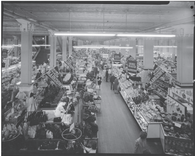
State Library of Western Australia