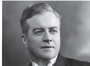
Lionel Logue.

Again it is hardly an unusual feature of historical drama to have actors considerably different in appearance from the real-life characters they portray. This is so with the film's two main actors, and especially Geoffrey Rush, though both of them gave fine performances. All the chief supporting players were quite good look-alikes, I thought.