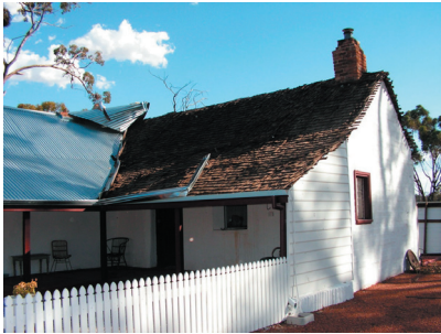
Homestead - damage to the roof.