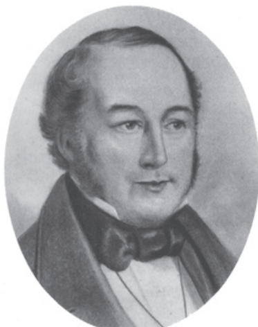
George Fletcher Moore ca 1841.

Our meeting will be held on Tuesday 8 March 2011 at 5.30pm for 6.00pm. (please note later starting time).