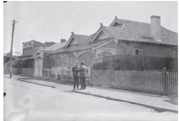
Josie Bungalow, brothel in Roe Street 1929