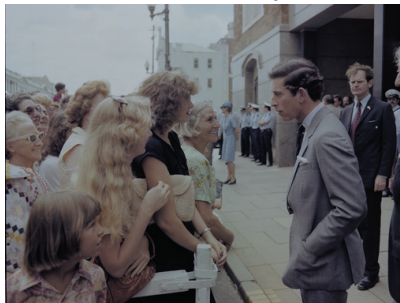
Prince Charles talks to women in the crowd outside the Town Hall, Perth, during his visit for the State's WAY '79 celebrations.

1979 was also the year of the 'sesquicentennial' anniversary of British settlement in Western Australia, and the State Cabinet Records show the deliberations by the Government about the use of the 'WAY 79' logo and celebratory events that occurred during that year including; Prince Charles' visit, the Parmelia Yacht Race, the Military Tattoo, and a 150th anniversary Golf Tournament. Western Australia was certainly in a 'state of excitement' throughout 1979.