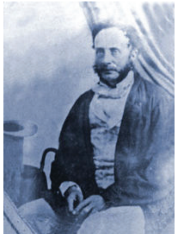
Sir Benjamin Pine.

Before long, Sir Francis had the satisfaction of seeing his advice accepted by the relevant adjudicators. A suitable parenthetical note was therefore added to the list of Governors in the Western Australian Parliamentary Handbook of 1998. And like all his better-known counterparts, Sir Benjamin was accorded a full page, with photo, in the glossy booklet, Governors and Premiers of Western Australia , put out in 2002 by the Constitutional Centre of Western Australia.