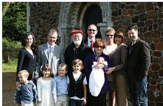
Godparents and family:

On a beautiful crisp sunny Sunday morning in mid-April, our two